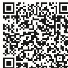
Bemo-Shield Plus Installation

A 20-year material warranty is available.